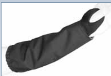
Bite Resistant Sleeves Version 1

We have now designed Cut-Tex® PRO lined bite resistant sleeves, sweat shirts and boiler suits, and supplied these to mental health care professionals around the world in order to prevent potentially very serious injuries.