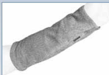
Bite Resistant Sleeves Version 2