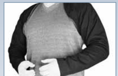
Bite Resistant Sleeves Full Arm Guards